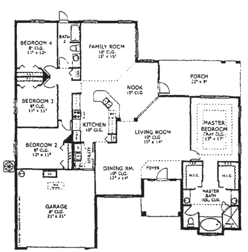
FIGURE 1. THE WESTMINSTER ^{152}