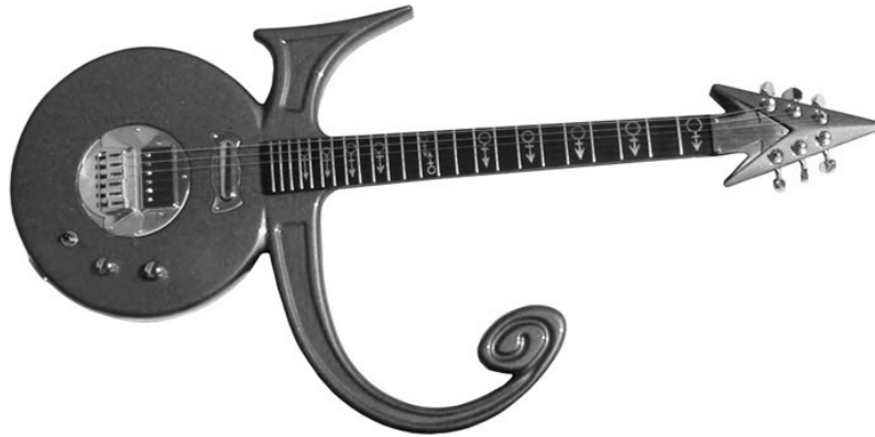
FIGURE 2: GUITAR RESEMBLING PRINCE'S CHOSEN SYMBOL